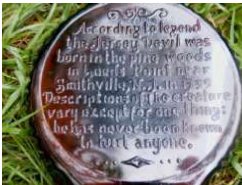
Fig.1 Shows a Clevenger Brothers, Clayton, NJ bottle I bought off eBay for only $25.00.