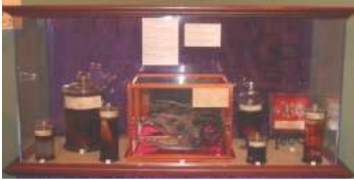
Fig. 6 Display showing The JD head.