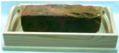
Fig. 5 Shows a brick from the foundation of the old farmhouse.