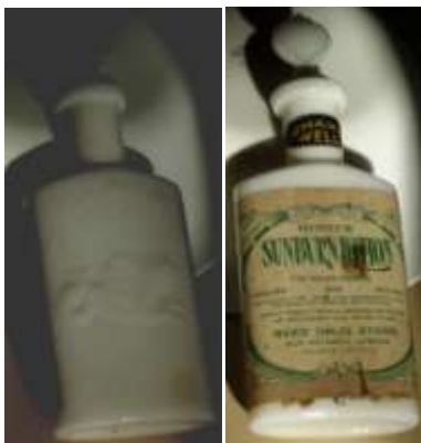
Fig. 2 Shows a Pharmacy Bottle from Atlantic City, that a friend owns.

Well it all began when I was a small tot at the age of seven (when gas was .25¢ a gallon). We lived in a small town in South Jersey called Belleplaine. This was a town where mostly everyone was related in some way or another. Except, The Tripet's, we were known as "outsiders," (if your last name didn't begin with the letters M, H, C or R, you was considered an outsider) who moved into town and had the first inside toilet (with running water) my Daddy bought this house at a Sheriff's Sale for only $200.00, he and my Mom and older brother gutted the house and modernized it.