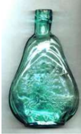
Fig. 3 Shows a Bitters made by somebody, I hocked it from the web, it might be Wheaton Glass.