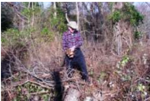
Fig. 6 Well that is me digging for bricks, I offered to sell some for him on my web site, he just lost his job.