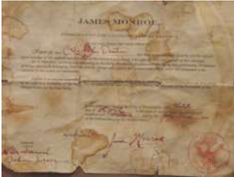
FIG. 7 The Order from Monroe to Decatur