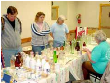
RMT talking to a customer