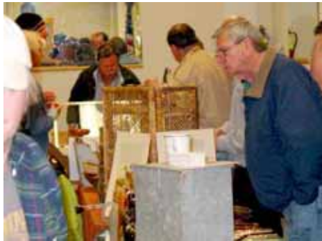
Yes Mam ...all my stuff is original.