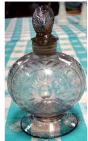
Real Nice bottles