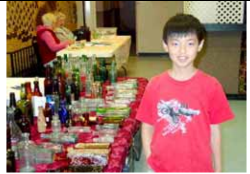
“A lot of interesting stuff.”