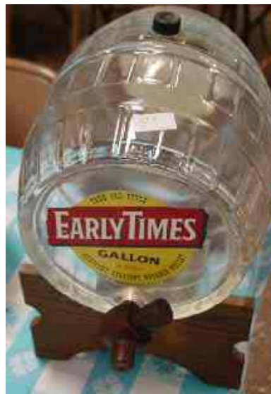
Early Times Dispenser.