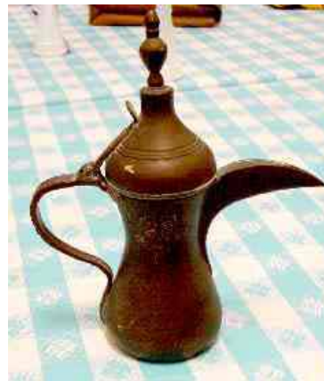
Metal Tea Pot—No Genie