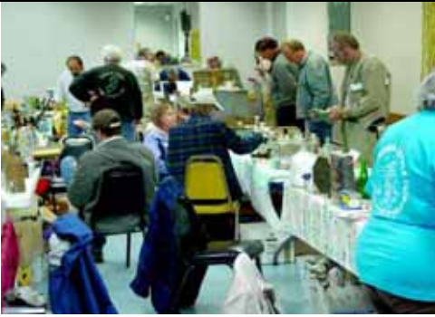
Some of the buyers