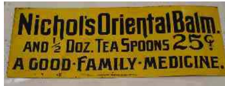
An original Barnegat Tin

WHAT ARE THESE? Made by JELL-O. Inserted in jell-o packs, discs of Airplanes and Cars on, only in Canada.