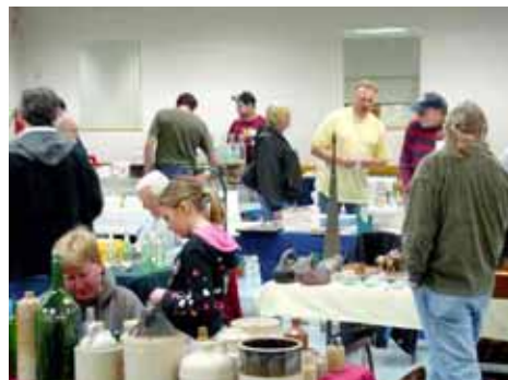
Checking out the stuff