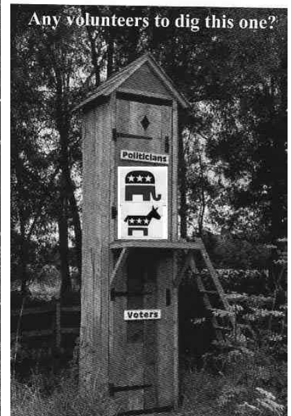
Left-AS APPEARED IN BOTTLES & EXTRA