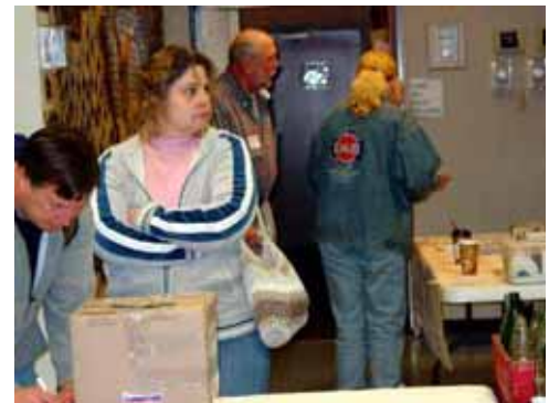
Hurry Up fill it out