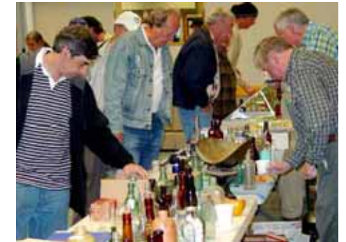
Many “Serious” Buyers