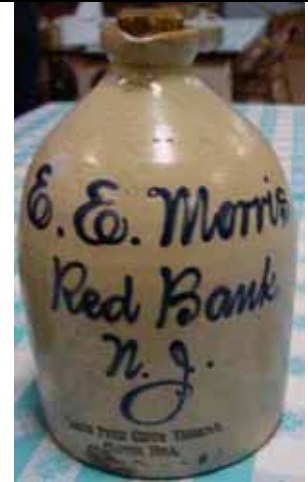
Red Bank Jug