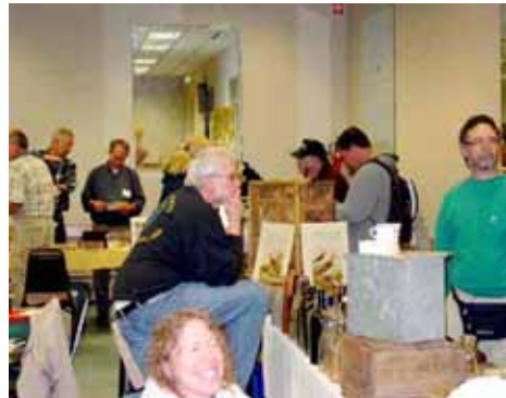
GV and HC discussing all the rain