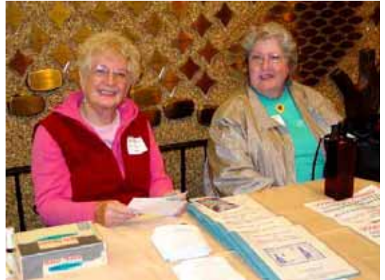
The Greeters: DO and RMT

It was a rainy day off and on, but many came and seemed to enjoy what they saw. Many left with bags full of things.