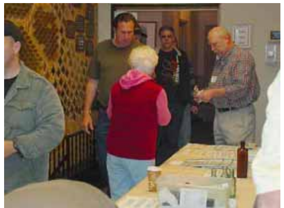
As They Come In