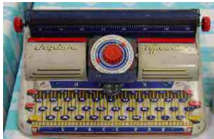
Junior Typewriter that used carbon paper.